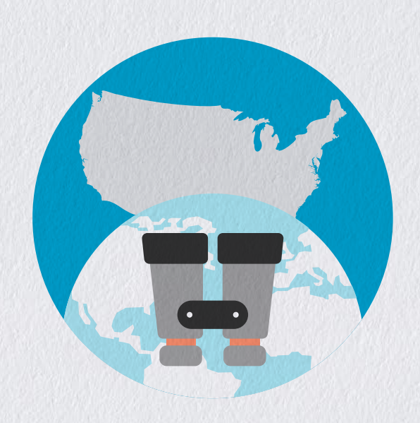
Civil Service Transition Programs