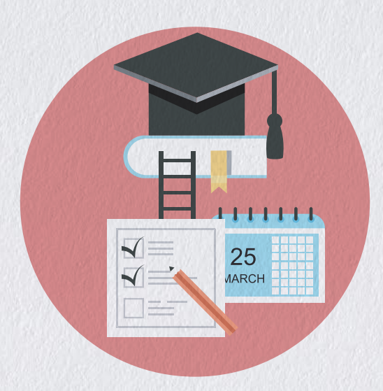
Career Planning & Training Resources